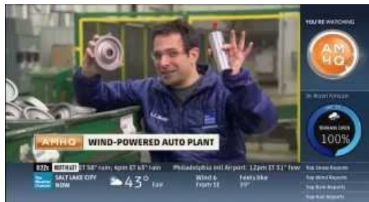
The Weather Channel

We have secured prime-time, live Business Television interviews for our clients, providing them with a national platform on which to tell their story to millions of investors.