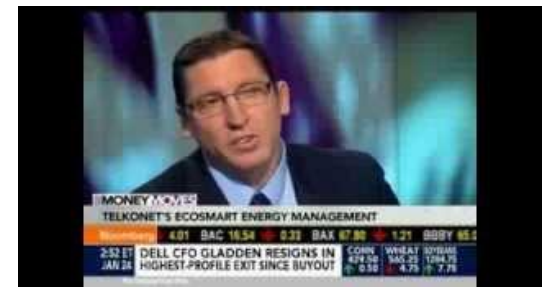
Bloomberg Television "Money Moves"