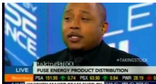
Bloomberg Television "Taking Stock"