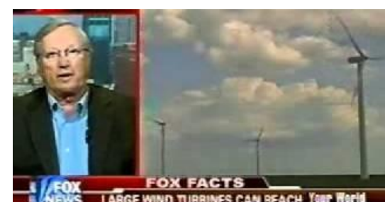
Fox News "Your World with Neil Cavuto"