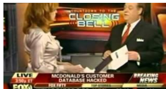
Fox Business "Closing Bell"