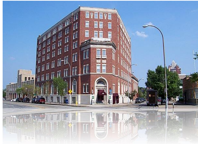
Harro East Building est. 1931